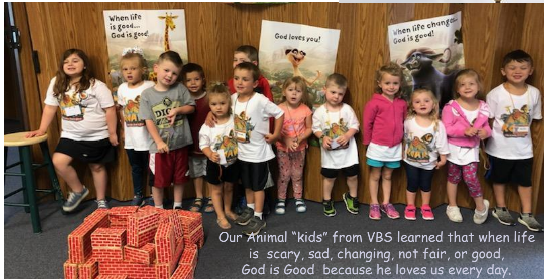
Our Animal "kids" from VBS learned that when life is scary, sad, changing, not fair, or good, God is Good because he loves us every day.